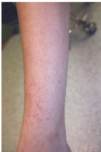
Fig. 3. Patient 1, donor leg 1 year after hair follicle extraction.

natural curvature of the follicle, giving an appearance of full and naturally curved eyelashes (Fig. 4). In patient 2, the nape hair eyelashes were rather straight and unruly without perming (Fig. 5) and slightly more unnatural looking. To sustain an orderly, naturally curled eyelash, the patient felt that regular perming by a professional at monthly intervals was necessary.