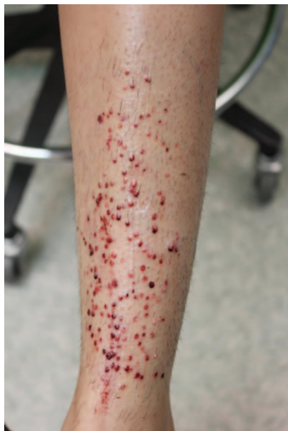
Fig. 2. Patient 1, donor leg after hair follicle extraction.

proximately 2–4 mL each eyelid) consisting of a 1:5 bupivacaine and lidocaine 1:100,000 mix was injected into the subcutaneous layer of the lower two thirds of the upper eyelids. A rotary tool (UGraft prototype apparatus; Keck-Craig, Inc., Pasadena, Calif.) was used to mount a cutting punch device (UPunch Rotary; Dr. U Devices Inc., Redondo Beach, Calif.) that was fabricated at the author's office. The customized punch tip has a cutting axis that points away from the follicles, thus minimizing trauma to the graft during extraction. Texturing at the punch tip pulls the graft up as it cuts around the follicle, thus minimizing the exactness with which the operator must trace the angles of the follicles below the skin surface. Patient 1 required 20-gauge punches due to the small caliber of leg hair, whereas patient 2 required use of 19-gauge punches due to thicker caliber nape grafts. Only single hair follicles were selected for grafting in both patients, and almost all surrounding skin was removed from the extracted grafts.