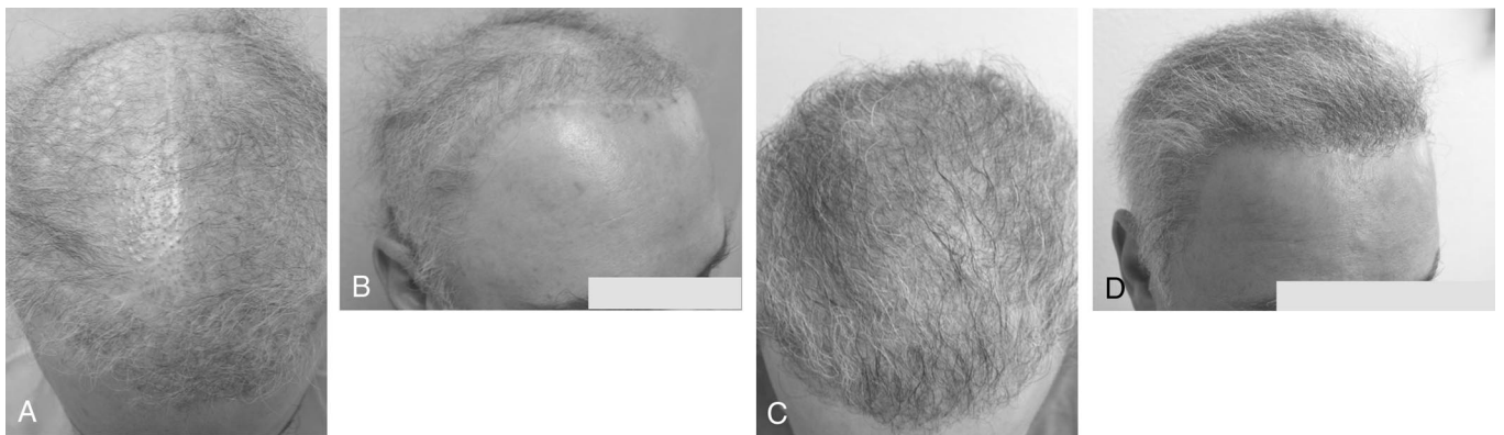
FIGURE 2. Case 2: A, Top view (before transplantation): Severe baldness involving an area corresponding to level 6 on the Hamilton-Norwood scale; scars of flaps and scalp reduction. B, Right oblique view (before transplantation): Global thinning; hairline scar from flap surgery. C, Top view (6 months after repair with beard and body hair): restored crown, mid scalp, and frontal scalp coverage. D, Right oblique view (6 months after repair with beard and body hair): Global coverage with restored hairline and obscuring of hairline scars.

Six months after surgery, the hairline has been refined and coverage achieved extending from the hairline and crown (Figs. 2C, D). Nearly 80% of the grafts survived.