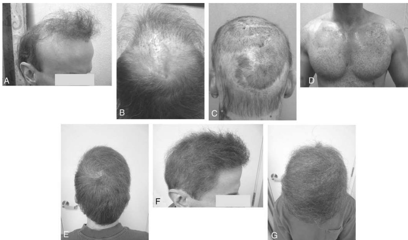
FIGURE 1. Case 1: A, Right oblique view: Loss of right parietal hair and temple secondary to patterned baldness and distortion of anatomy by the pulling forces of several scalp reductions. Thick plug-like transplants producing a scant forelock effect. B, Crown view: empty distorted crown occupied by a stretched scar of scalp reduction. Visible plug-like transplants in the frontal scalp. C, Back view (shaved): cicatricial (scarring) alopecia from multiple scalp surgeries. D, Chest area soon after extraction of chest grafts. E, Back view (1 year after repair with beard and body hair): Scars in the back are obscured with complete crown restoration and creation of a natural whorl. F, Right lateral view (1 year after repair with beard and body hair): Right parietal half and temples have been restored. Hairline and frontal scalp rehabilitated. G, Top view (1 year after repair with beard and body hair): Crown, midscalp, and front have been restored.

A 36-year-old white male had undergone several scalp reductions and follicular unit strip surgeries, resulting in a severe slot deformity of the crown, continuing baldness, plug-like transplants, and a hairline associated with ridging and pitting (Figs. 1A, B). He was severely bald with several cicatricial alopecia plaques in the head donor area and crown, and his head donor area was severely depleted (Fig. 1C). The patient had his slot deformity addressed with a tissue expansion and flap surgery prior to the current hair transplantation. Hair transplantation was carried out using about 12,000 chest (Fig. 1D), abdomen, and shoulder hair grafts, 9000 beard grafts, and 1000 head hair grafts to cover his bald areas and scars.