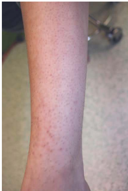
Fig. 3. Patient 1, donor leg 1 year after hair follicle extraction.

natural curvature of the follicle, giving an appearance of full and naturally curved eyelashes (Fig. 4). In patient 2, the nape hair eyelashes were rather straight and unruly without perming (Fig. 5) and slightly more unnatural looking. To sustain an orderly, naturally curled eyelash, the patient felt that regular perming by a professional at monthly intervals was necessary.