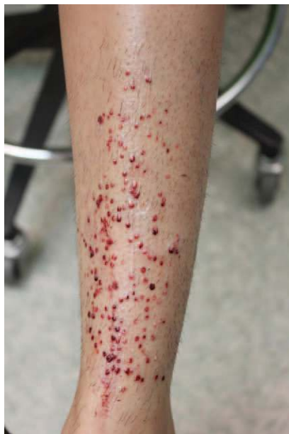
Fig. 2. Patient 1, donor leg after hair follicle extraction.

proximately 2–4 mL each eyelid) consisting of a 1:5 bupivacaine and lidocaine 1:100,000 mix was injected into the subcutaneous layer of the lower two thirds of the upper eyelids. A rotary tool (UGraft prototype apparatus; Keck-Craig, Inc., Pasadena, Calif.) was used to mount a cutting punch device (UPunch Rotary; Dr. U Devices Inc., Redondo Beach, Calif.) that was fabricated at the author's office. The customized punch tip has a cutting axis that points away from the follicles, thus minimizing trauma to the graft during extraction. Texturing at the punch tip pulls the graft up as it cuts around the follicle, thus minimizing the exactness with which the operator must trace the angles of the follicles below the skin surface. Patient 1 required 20-gauge punches due to the small caliber of leg hair, whereas patient 2 required use of 19-gauge punches due to thicker caliber nape grafts. Only single hair follicles were selected for grafting in both patients, and almost all surrounding skin was removed from the extracted grafts.